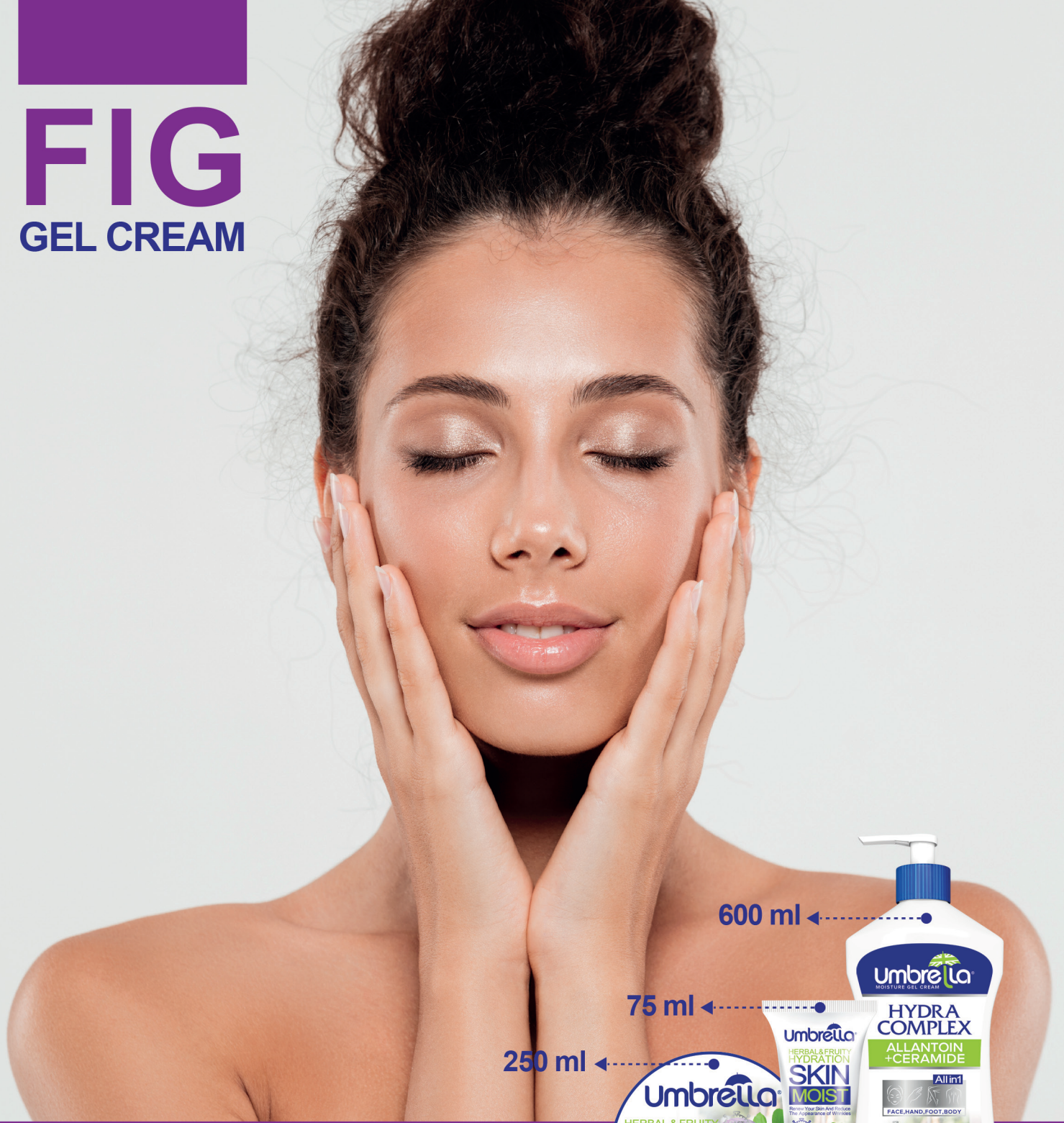
FIG GEL CREAM